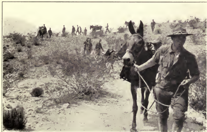
THROUGH THE FOOT-HILLS